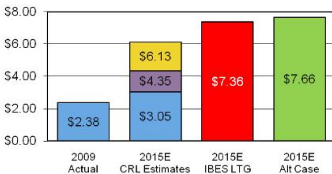
CRL Standalone, with Stock Repurchases (2)(3)